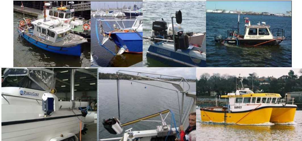
Over the side mount, bow mount, temporary or permanent installation, large or small vessels, GeoSwath Plus is suitable for all situations