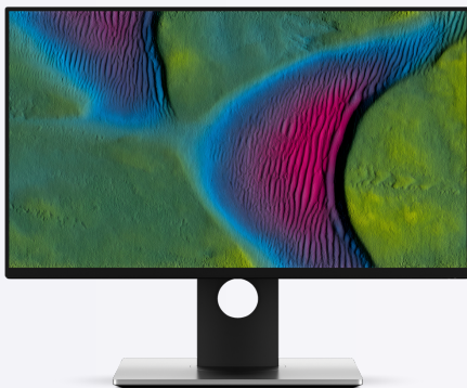
Holm Sand, Lowestoft, UK

*GeoSwath 4 can also be interfaced to third-party software for acquisition and processing.