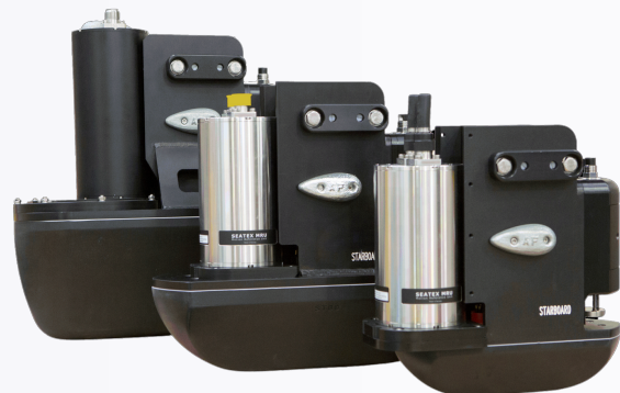
125 kHz, 250 kHz and 500 kHz transducers