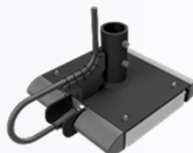
Kongsberg TOPAS PS120