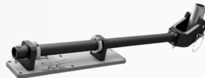
Boom Mounting Plate

Optional support arms are available for mounting a range of dual antenna GNSS receivers or combined systems with additional brackets.