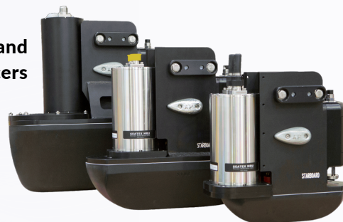
125 kHz, 250 kHz and 500 kHz transducers