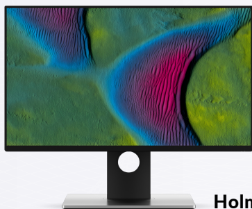
Holm Sand, Lowestoft, UK

*GeoSwath 4 can also be interfaced to third-party software for acquisition and processing.